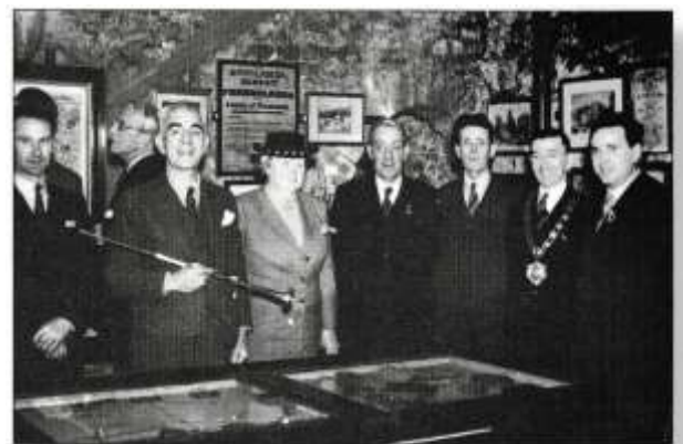
Photographs taken at the opening of the Museum in the Town Gate, April 9th 1949.