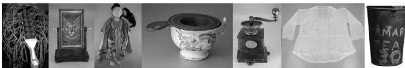
Inclusive Histories—The Power of Collections to Bring Communities Together

Museums and the culture sector are playing an important role in delivering Welsh Governments Anti-Racist Wales Action Plan. Within the culture, heritage, and sport section of the plan there are goals and actions that aim to recognise and celebrate past and present racial and ethnic diversity in Wales. MonHeritage has been successful in securing funding from Welsh Government to contribute to this important work, and working alongside our local communities is central to this project.