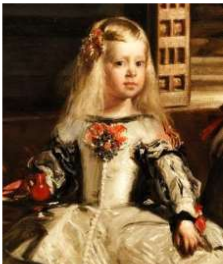
Diego Velasquez, Las Meninas, detail, 1656 (Prado)