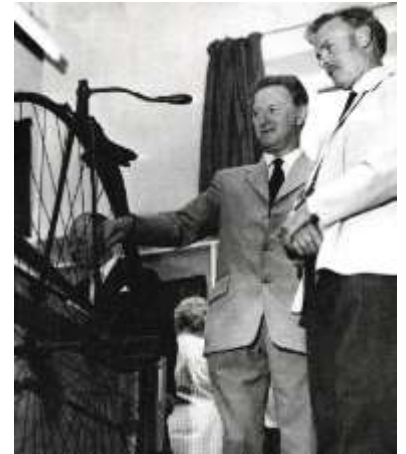
With writer Alexander Cordell in 1971, when the Museum moved into the old Board School.