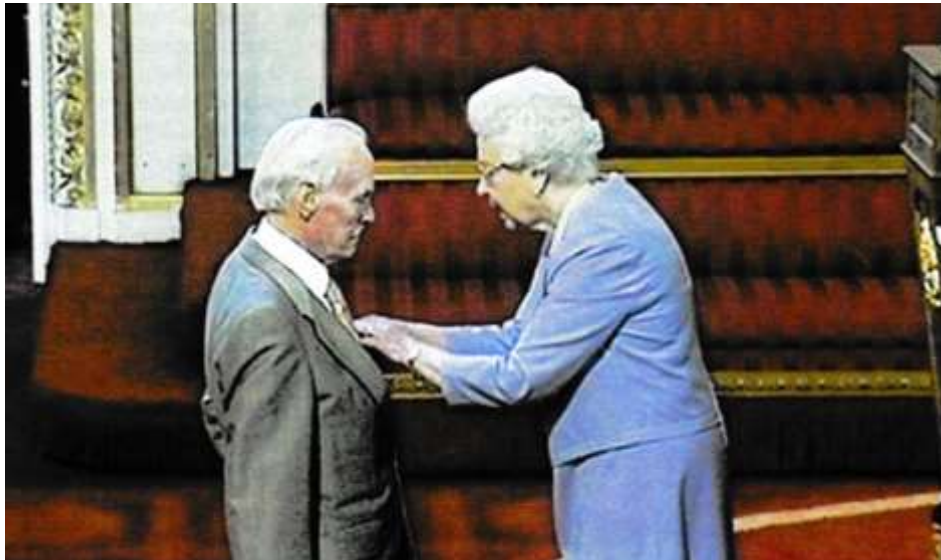
Receiving the MBE from Her Majesty the Queen in 2012