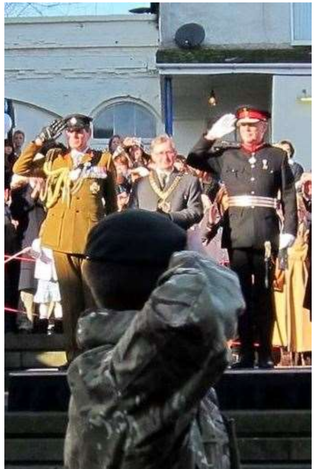
As Mayor in 2011, taking the salute when 1 Rifles received the freedom of the town

He was a friend to many of us, a mainstay of the town, and will be sadly missed by all.