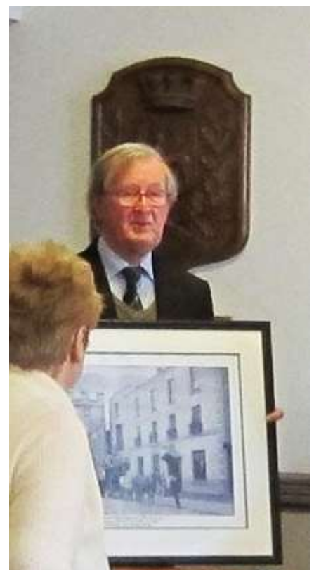
On leaving the Town Council in 2012