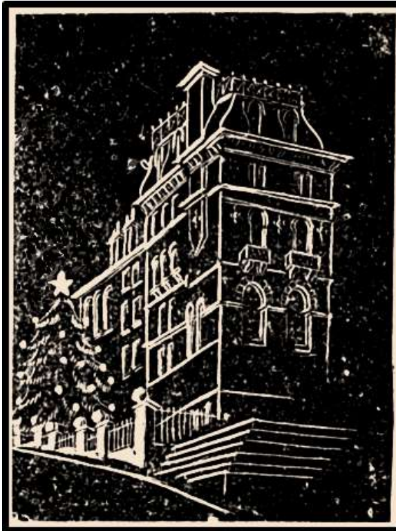
Chepstow's Christmas tree used to stand outside this Bank Building which was demolished in 1969.