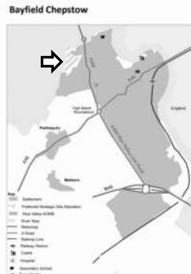
Proposals for new housing in the Monmouthshire Replacement Local Development Plan (RLDP) Revised Preferred Strategy, December 2022