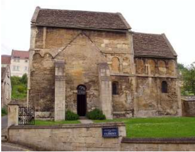
St Laurence's, Bradford-on-Avon – a rare Saxon foundation