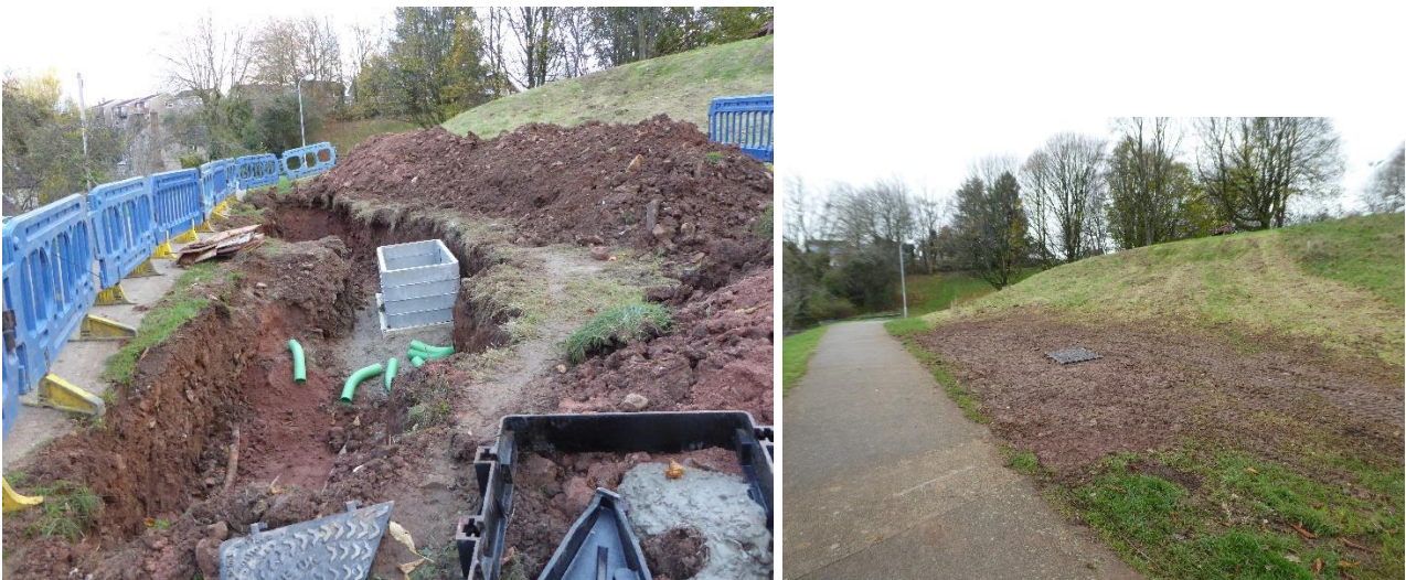
Figure 9 - new electricity manhole in Piggies Hill

There was some work in Piggies Hill relating to Electricity supply. A new manhole has been installed.