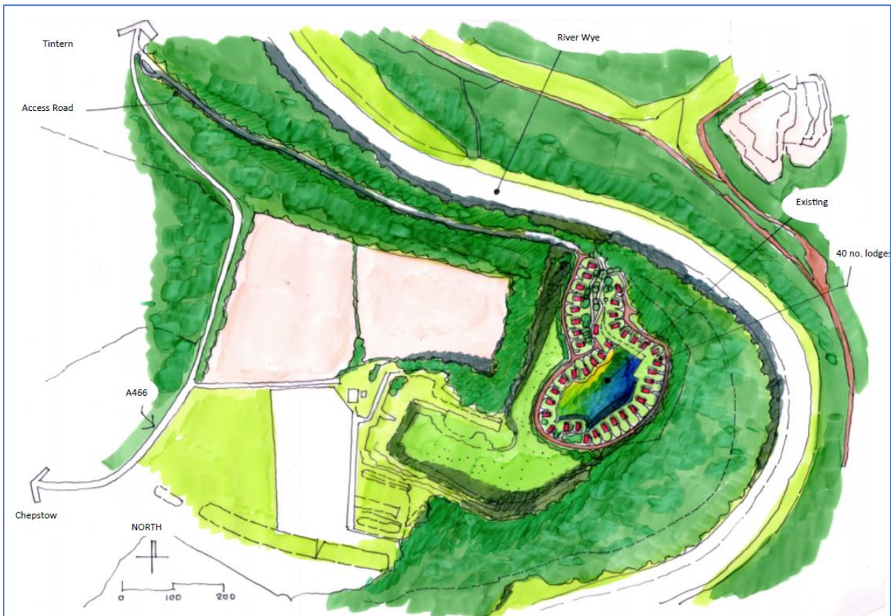
Figure 5 - Livox Quarry illustrative plan

This site is on the loop in the Wye just north of Lancaut, and is accessed from the St Arvans – Tintern Road. This is only an initial proposal and was flagged up in the South Wales Argus recently. However the proposal was put in 2020 so is not particularly new. The proposal is to turn the old quarry site into a landscaped holiday park with 40 log cabins. An illustrative plan is shown below.