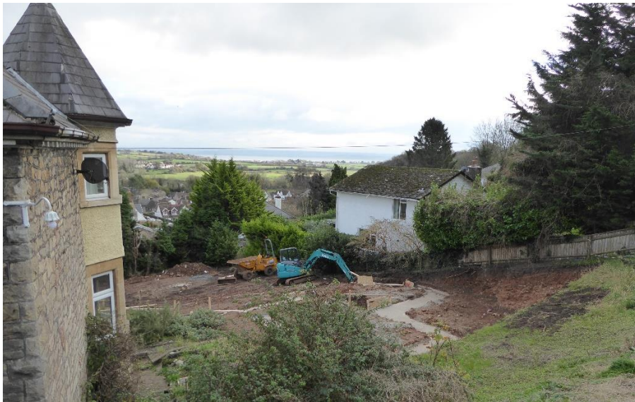
Figure 4 - another view of the site, with Grosmont to the left