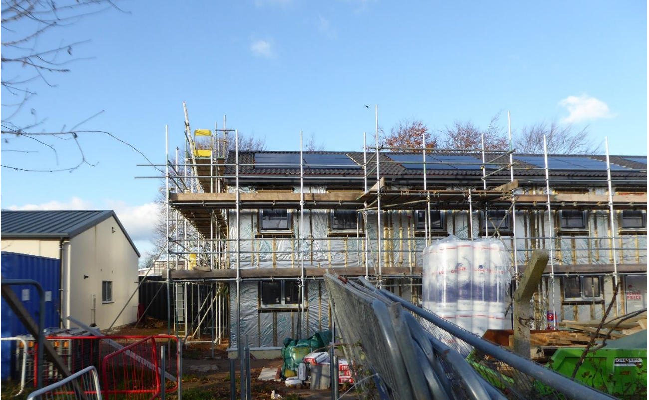
Figure 6 - part of the new development, with the Scout Hut visible to the left

Work on this housing association site is well progressed. The work on the adjacent Scout Hut appears to be complete.