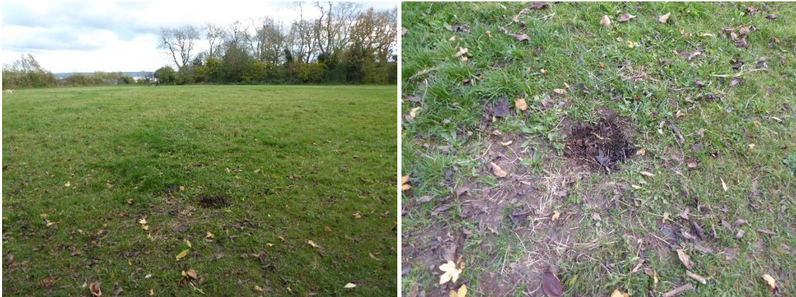
Figure 11 - evidence of metal detecting in the Bulwarks

It looks as though there has been some night-hawking (metal detecting) in the Bulwarks Hillfort. This has happened before. It is a scheduled ancient monument and this activity is illegal.