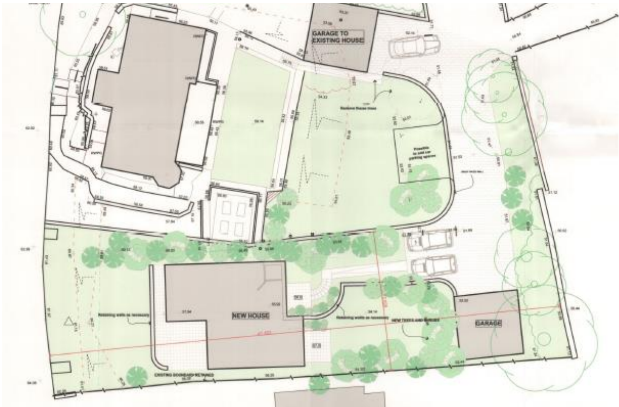
Figure 2 - a more detailed plan of the new building, below; Grosmont above