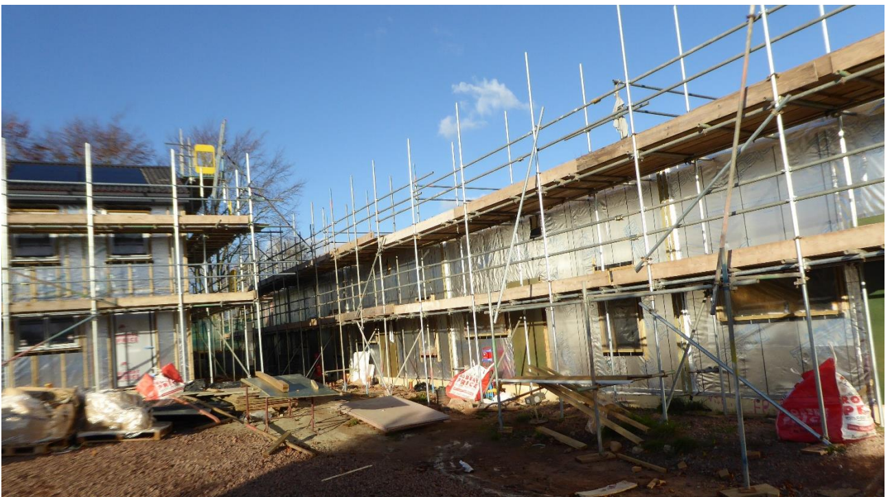
Figure 7 - the other (eastern) end of the developments