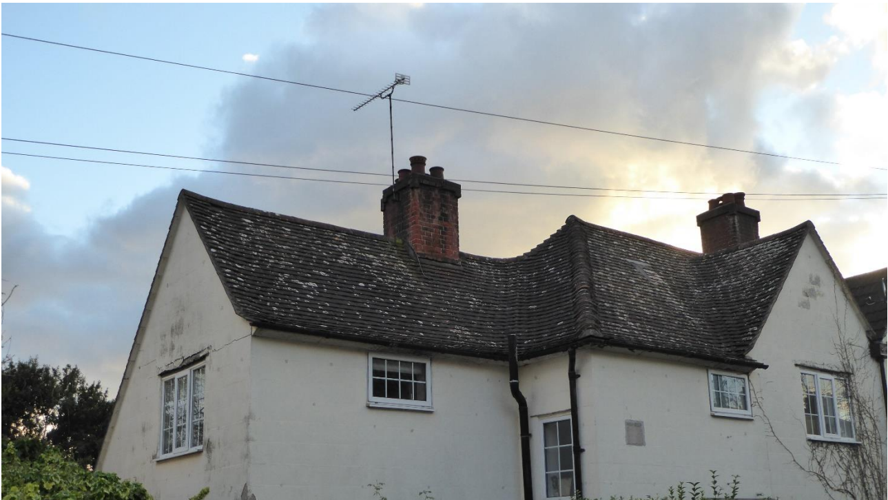
Figure 12 - A lovely old roof in Garden City

But to end on a positive note, this is lovely example of roofing in Garden City, almost certainly original. The details, shaping and forms are great craftsmanship.