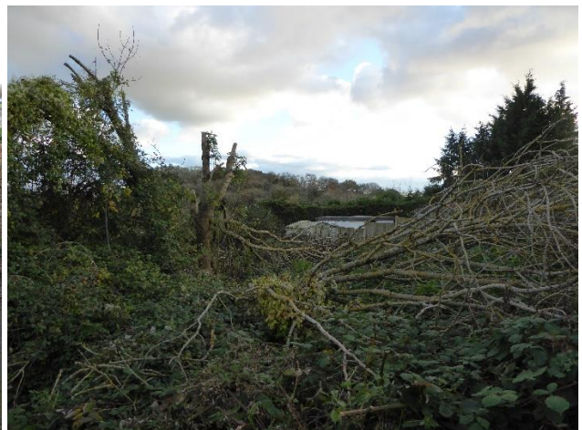
Figure 10 - Tree vandalism in Warren Slade along side the coastal path