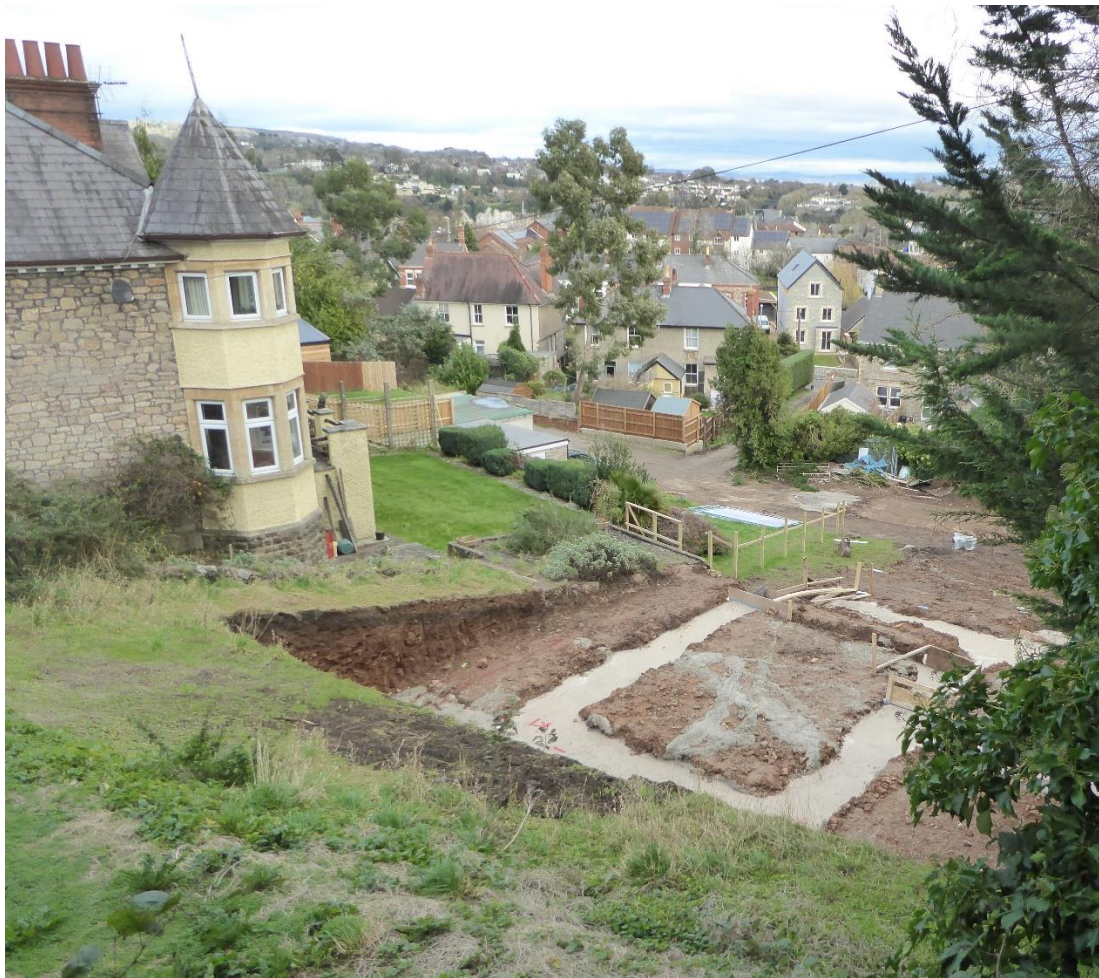
Figure 3 - view of the site and works from Mount Pleasant