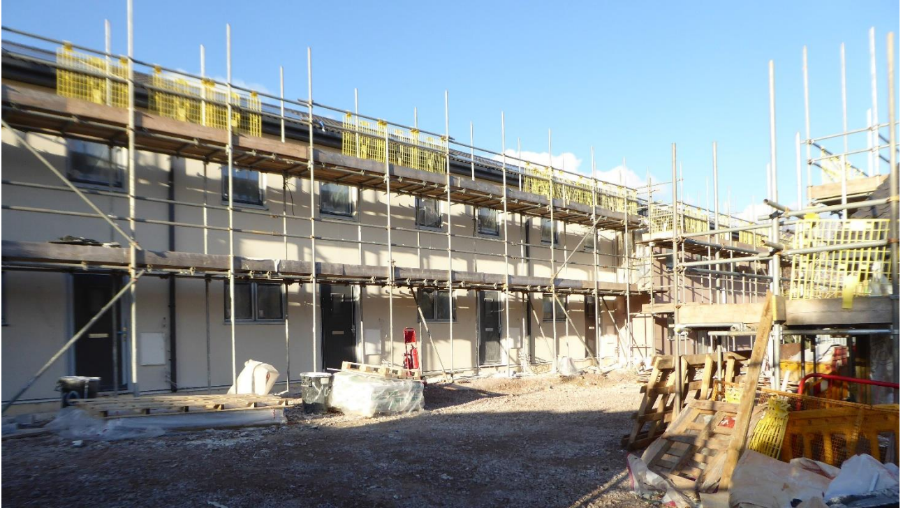
Figure 8 - new houses on Western Avenue site

This is another housing association site on an old garage block site in Bulwark which is also well progressed.