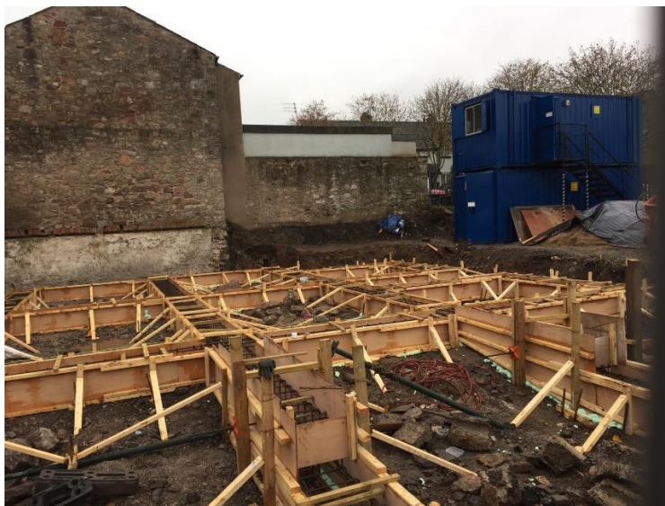
Figure 4 - Foundations for the new cottages on the old ATC site in Lower Church St