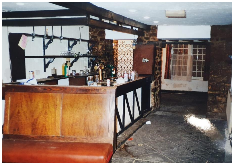
Figure 2 - The way it used to be at the Queens Head, looks really nice now