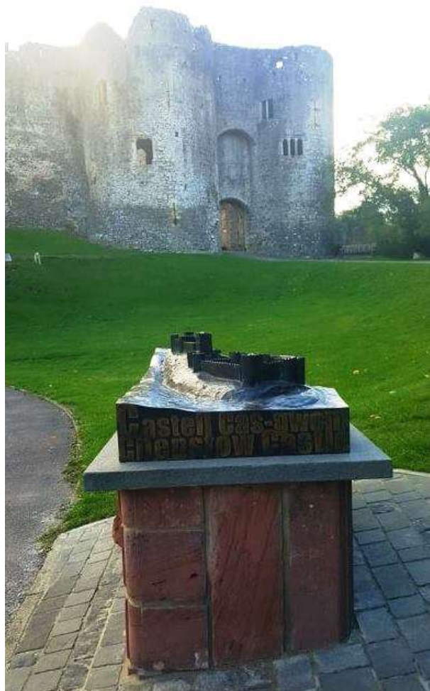
A new addition at the castle...