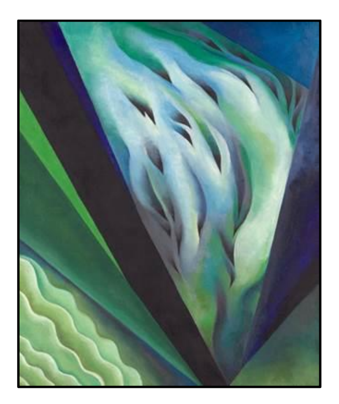
Image: Georgia O'Keefe, Blue and Green Music, 1919-21, The Art Institute of Chicago

To book: www.visitmonmouthshire.com/okeeffe